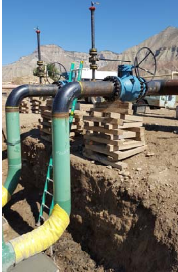
Fabrication Assembly Garfield County, Colorado

Pipeline & Facilities Engineering: · Route selection · Pipeline