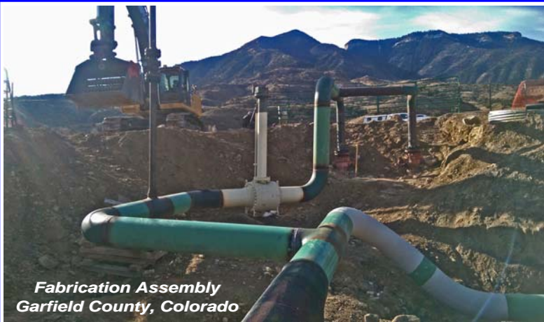
Fabrication Assembly Garfield County, Colorado

Material Procurement & Control: Technical specifications · Supplier identification · Transportation and delivery plans · Bid solicitation & evaluation · Requisitions & purchase orders · Plant & mill inspection service coordination · Scheduling and expediting · Material receipt & control · Test witnessing · Material inventory and cost summary · Tax district allocation summary · Surplus and scrap material inventory.